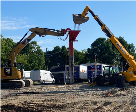
Action shot of the aggregate pier installation process