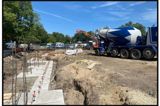
Concrete footings along north property line poured this week

Building demolition, aggregate piers, and site excavation/clearing are all complete leading to the first footing pour, which happened earlier this week! Progress will continue around the perimeter of the building as the crew pours more footings and foundation walls. Once the foundation work is wrapped up in the coming weeks, you'll begin to see the structure go vertical, stay tuned!