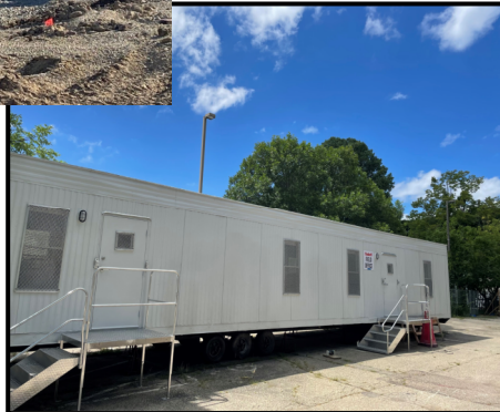
The job trailer was recently added to the parking area, which is now the break area for workers