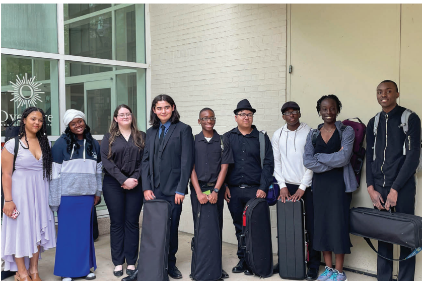
The Music Makers Forte Upper Strings perform at the MSO's Symphony Soup.

College and Scholarship Applications, Music Pedagogy, Employment Opportunities, Financial